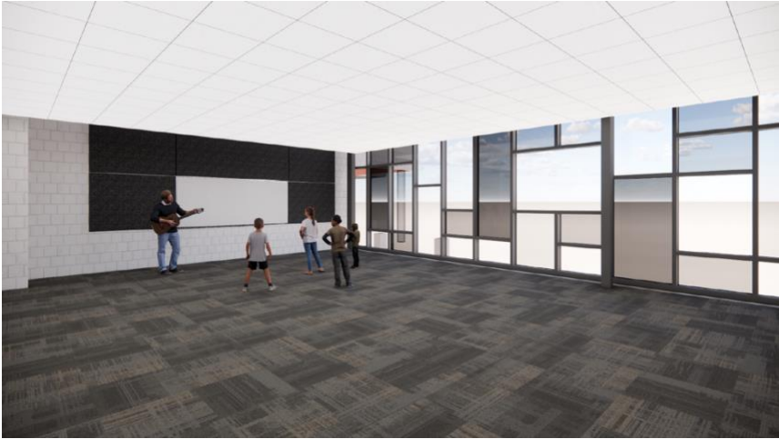
New DES Music Room—Tentative Completion December 31, 2021

Currently, the DES project is slightly under budget. The first series of bonds to finance the renovations has been sold at a very competitive interest rate, saving taxpayers approximately $3.7 million in interest costs compared to pre-bond estimates. Construction bids have been approved by the board of education and contractors are preparing to begin work on April, 2 nd .